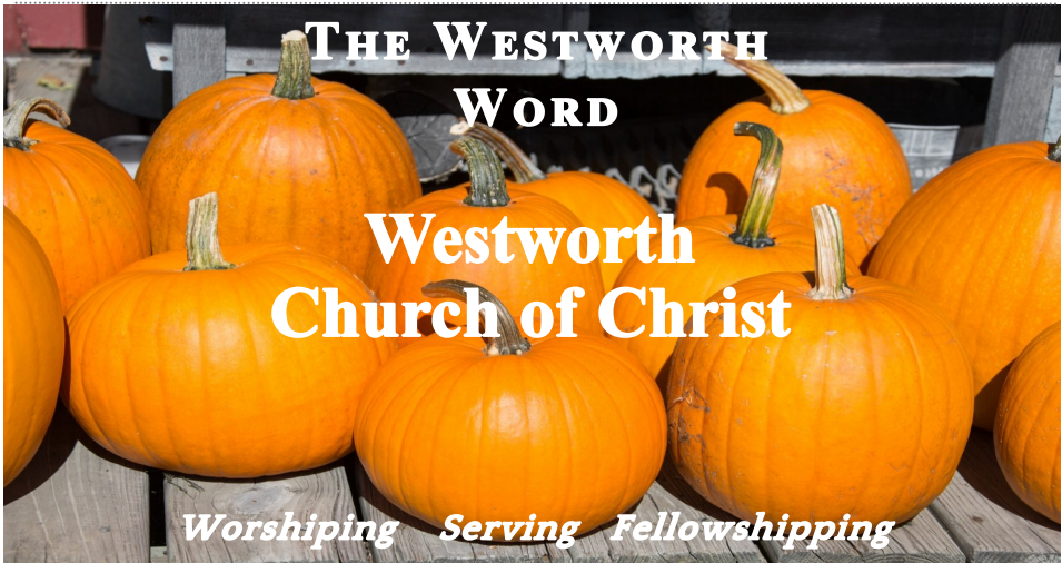
WELCOME VISITORS! Thank you for joining us today to worship the Lord.

If you are looking for a supportive, Bible-based church family, we believe you have found it at Westworth. You are always welcome to be a part of the warmth and loving nature that is shown here . We have a place for you!