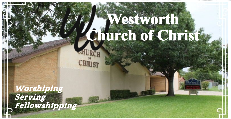
WELCOME VISITORS! Thank you for joining us today to worship the Lord.

If you are looking for a supportive, Bible-based church family, we believe you have found it at Westworth. You are always welcome to be a part of the warmth and loving nature that is shown here. We have a place for you!